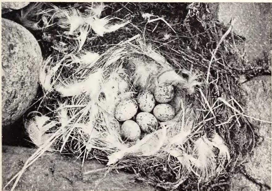
Fig. 7 b, c